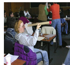
Participant in the 2006 Astronomy Saturday Seminar

Topics covered included the Powers of Ten, Atomic Force Microscope, Self Assembly, Magnetic Memory, Nano Particles, Nano Filtering, Nano Impact, Careers, and Applications, Lithography, and Nanomedicine. Activities included a gel diffusion experiment, an oleic acid demonstration, and a small group research activity called Jigsaw where participants divide up a large amount of reading material into study groups. Participants were given a tour of the Center for Hierarchical Manufacturing, which was followed by a "virtual tour" of the Clean Room Lab located in the Sylvio Conte Building. As has been done in previous institutes, all of the materials, presentations, and activities are online at umassk12.net/nano/materials . This year, Moodle software, used for online courses, was used to create a shared learning community. Please visit the STEM Ed website for more information, including pictures, PowerPoint lectures, and the Institute agenda. This institute will be offered again in 2012 and information will be available by November.